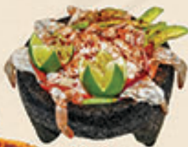
Mariscos de Ceviche